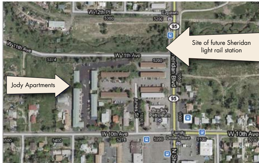
Figure 3: Location of Jody Apartments and future Sheridan Light Rail Station

Jody Apartments underscores the need for creative acquisition financing for affordable housing developers working in markets with active real estate speculation. To acquire and hold properties for future redevelopment, CDCs need access to patient capital and flexible underwriting. Early access to acquisition capital is essential if developers are to secure control of key properties. Since the Jody Apartments acquisition, the city of Denver, Enterprise and the Urban Land Conservancy have jointly created the Denver Transit-Oriented Development Fund to fill this need.