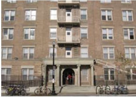
The Martin Luther King, Jr. Latino Cooperative

until the residents were notified of his intent to sell the building to a for-profit purchaser known for condo conversions.