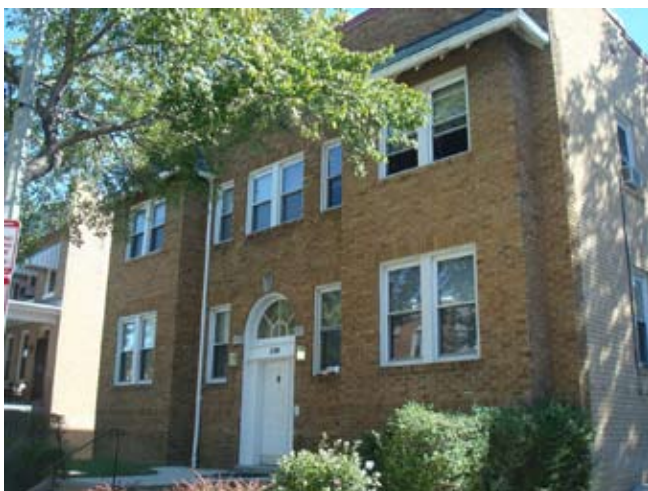
The Marian Russell Cooperative

A majority of the cooperative's residents earn less than 50 percent of the area median income while several earn well below 30 percent. These long-term residents saw their community gentrifying and established the goal of maintaining affordability for everyone in the building, which is located near Metro and major bus lines, within blocks of a major grocery store and only minutes from popular Eastern Market. To assist in maintaining affordability for the lowest income residents, the cooperative successfully applied for Local Rent Supplement Vouchers. These vouchers provide the same type of rental assistance to households earning less than 30 percent of the area median income as Section 8 but are funded by the city.