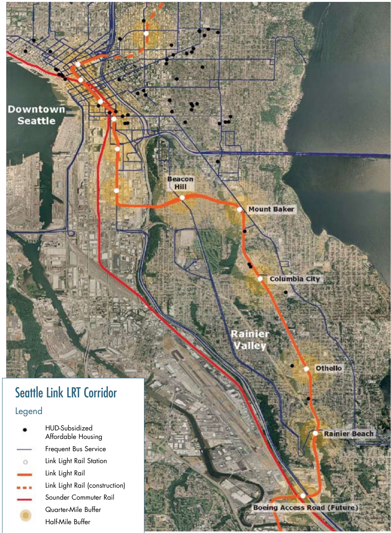
Figure 6: The Seattle Southeast Transit Corridor