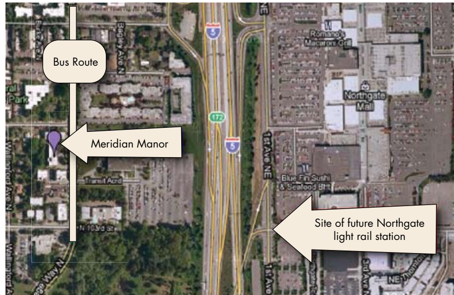
Figure 4: Location of Meridian Manor and future Northgate Light Rail Station

Revitalizing Seattle's Northgate neighborhood has long been a priority for city leaders. Anchored by the Northgate Mall, this northern Seattle neighborhood provides easy access to civic, retail, office and medical facilities. In recent years, the neighborhood has benefited from significant public investment to improve the livability of the area, including the addition of a new community center and library, new parks and improved transit opportunities.