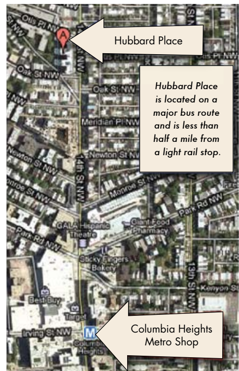
Figure 7: Location of Hubbard Place and nearby transit

Hubbard Place was preserved in the midst of the huge Columbia Heights transformation. Somerset Development, a for-profit affordable housing developer, worked with the tenants’ association to purchase the property. Political and community leaders feared that the private, for-profit owner planned to convert the building to market-rate housing given the area’s rapid gentrification.