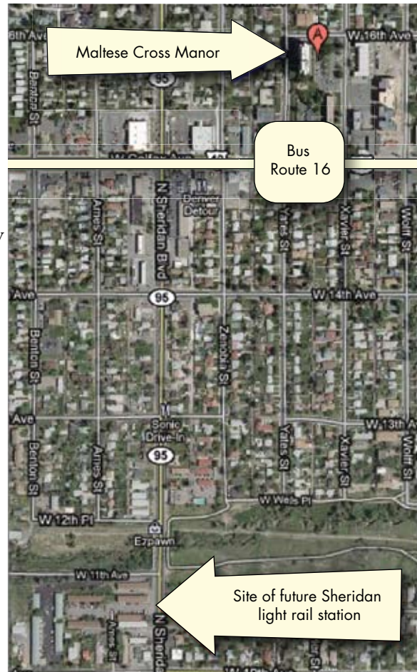
Figure 1: Location of Maltese Cross Manor and existing and proposed transit

Mercantile Square's initial 15-year LIHTC compliance period will expire in 2011. Extended use restrictions imposed by CHFA prevent a conversion to market-rate use. Although the property is generally in good