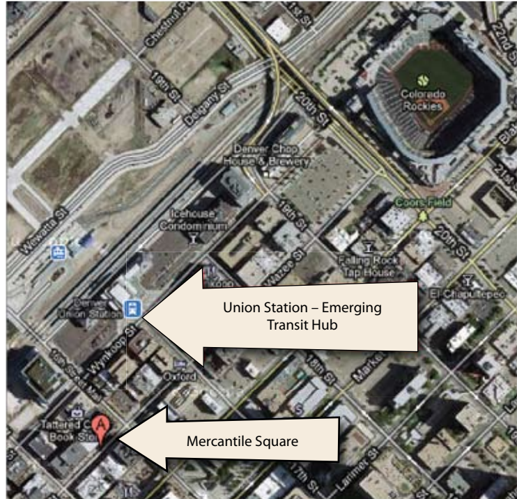
Figure 2: Denver's Lower Downtown (LoDo) neighborhood and location of Mercantile Square

In a surging neighborhood like LoDo, where current land prices make new affordable housing construction infeasible, investing to extend the life of existing housing like Mercantile Square remains the most cost-effective means to provide housing that serves the area's low- and moderate-income workers.