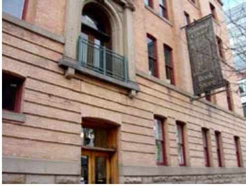
Denver's Mercantile Square has 100 units above the Tattered Cover Book Store.

condition with replacements and upgrades adequately funded as needed, its physical needs are increasing with age. The owners will utilize project reserves and look for other means to continue to maintain the property in good physical condition as affordable workforce housing.