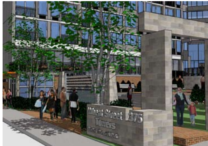
Architectural rendering of Wheat Street Towers and Gardens

The Towers are located only one-half mile from the King Memorial MARTA stop, serving both the blue and green lines, and within walking distance of multiple bus routes. A block from Wheat Street Towers is the site of the former Wheat Street Gardens apartment complex. The project, which once contained 230 HUD-assisted units, was demolished in 2009 after becoming severely distressed and plagued by crime, fire damage and squatters.