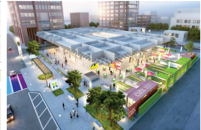
Midtown Station View from Peachtree Place