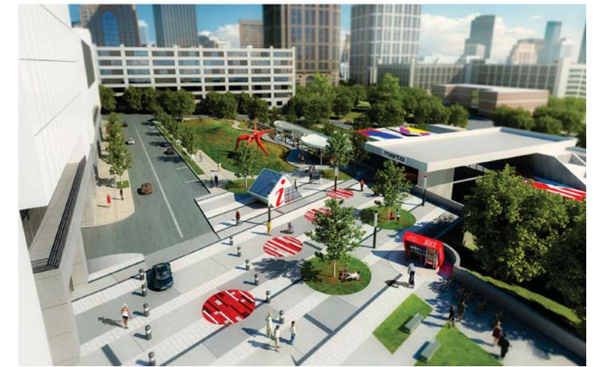
Transit Plaza View from the Woodruff Arts Center Station